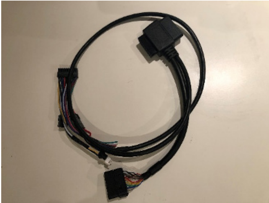
OBD Universal Y cable